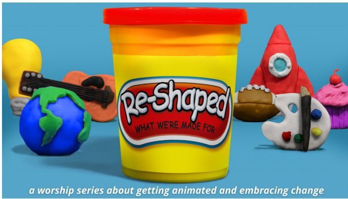
a worship series about getting animated and embracing change

who had to be suspicious of difference in order to survive. But this part of our psyche can cause us, and others, no end of frustration and fear. And it can keep our communities stuck in a way that prevents us from our joy and our passion for ministry.