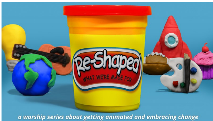
a worship series about getting animated and embracing change

who had to be suspicious of difference in order to survive. But this part of our psyche can cause us, and others, no end of frustration and fear. And it can keep our communities stuck in a way that prevents us from our joy and our passion for ministry.